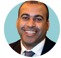
By Jason Booth GaNTIP director

The Grounds and Natural Turf Improvement Programme is piloting a new approach to the 'measurement' of the standard of football pitches at grassroots level